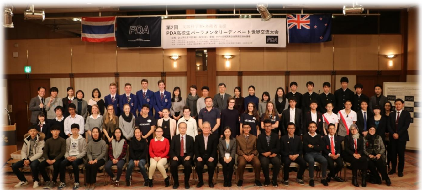
Group photography after the closing ceremony