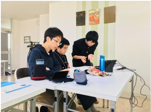
Tokai (Aichi) vs Kobe (Hyogo)