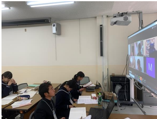
Yatsushiro (Kumamoto) vs St. Ursula (Aomori)

(Photos) Tablet PCs, Wi-Fi, and speakers presented from KDDI foundation and Yamaha cooperation put to use. Some schools also used projector screens. The opponent's speeches were clearly heard, and students were able to debate and communicate in the same way as they usually would, face to face.