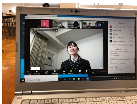
※Filmed from headquarters (OPU)