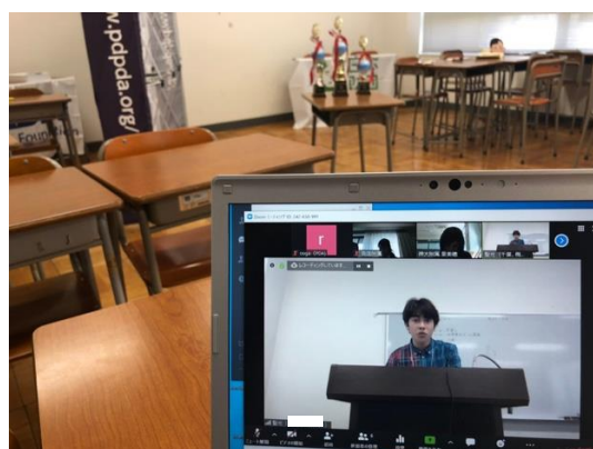
Seiko (Kanagawa) vs Ryogoku (Tokyo)

The motion for round 2 was “Closing schools to combat the COVID-19 has brought more benefits than harm.” The Government argued that it was beneficial for the prevention of spreading COVID-19, but the Opposition explained the current situation where ceremonies were cancelled and parents had to take days off for their children staying at home.