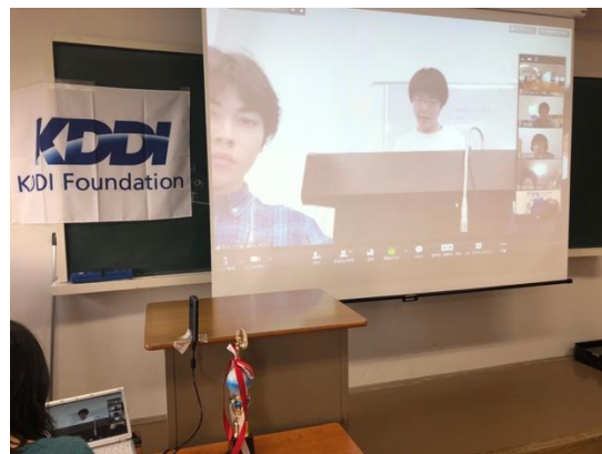
Grand finalists proudly delivered speeches as many people watched