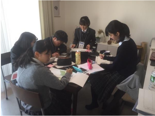
Seiko (Kanagawa) vs Ryogoku (Tokyo) ✳Shot at student's home