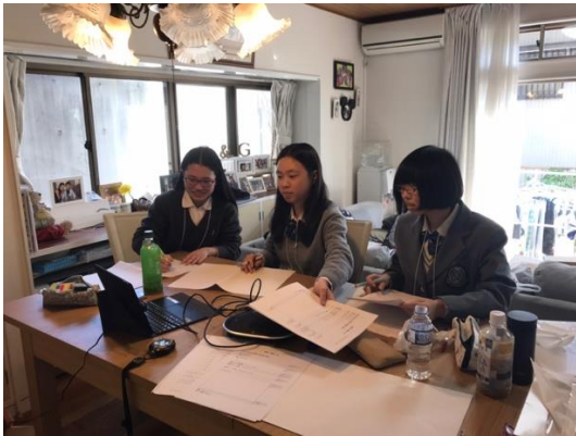
Eiko (Kanagawa) vs Shibuya (Tokyo)