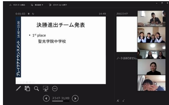
Waiting for the reveal of breakthrough teams

The motion for the grand final was “Recreating the dead in VR does more benefits than harm.” As many people watched, grand finalists proudly delivered speeches made from deep analysis and strong rebuttals. The grand final became a very heated debate.