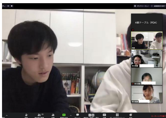
Tsukuba (Tokyo) vs Kobe (Hyogo)

Next, the first preliminary round began. Matchups and motions were presented in the main room, and students moved to different chatrooms, where they will debate. In each chatroom, PDA staff created breakout rooms (smaller sessions created in chatrooms) and divided students into Government and Opposition groups for preparation. The motion for round 1 was “Bringing snacks and soft drink to junior high school should be allowed.” Points from the student’s own experience, including harm to health and concentrating in class were debated. After the debate, the judges gave feedback, and the students asked questions to deepen their understanding.