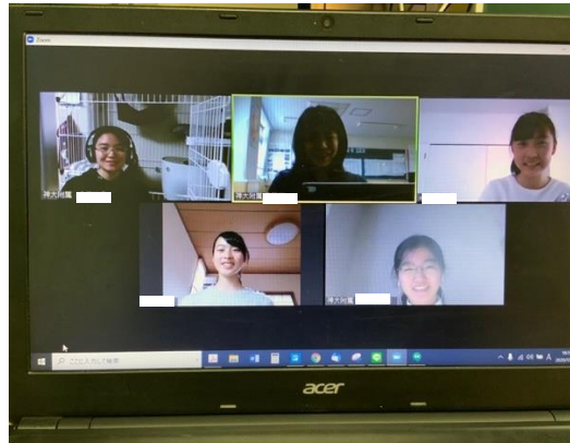
Kobe (Hyogo) from student's homes