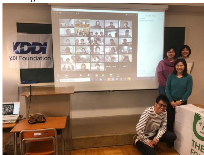
Photo of participants and HQ staff