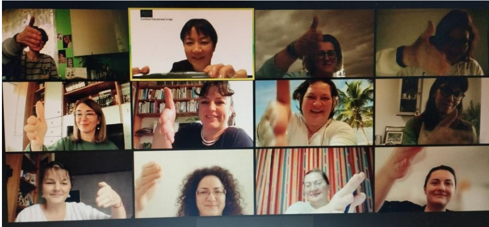
Shaking hands after the round

The motion for final round was “Politics is better done by AI than by humans.” Each team could compare AI and human characteristics in their analysis.