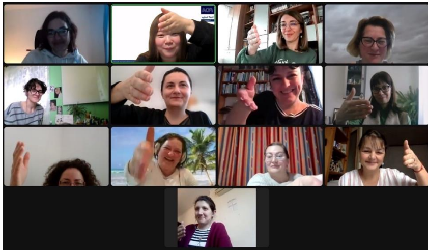
Shaking hands after the round

The motion for 3 rd round was “Being single is better than married.” While each of the participants held the opinion that it depends on personal preference, they logically explained their opinions in support of their assigned side.