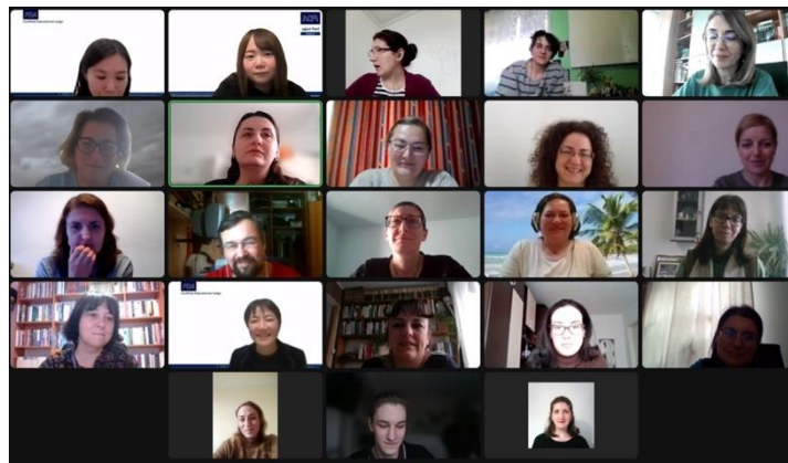
Share impressions and comments

After four debate rounds, participants shared their impressions of the day and the difficulties they encountered.